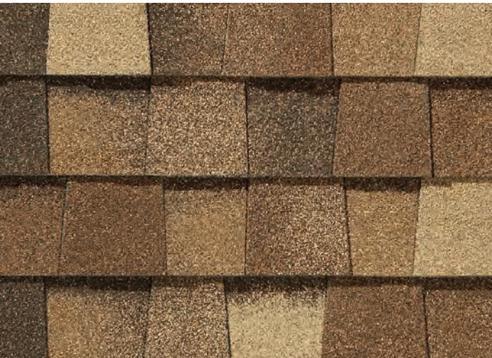
Max Def Resawn Shake