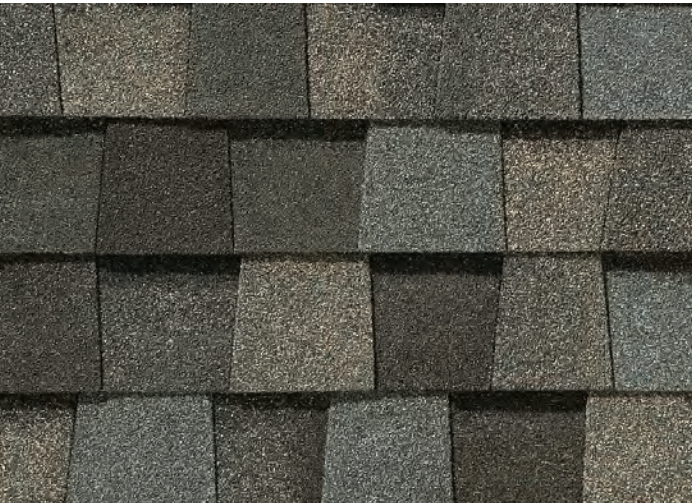
Max Def Weathered Wood