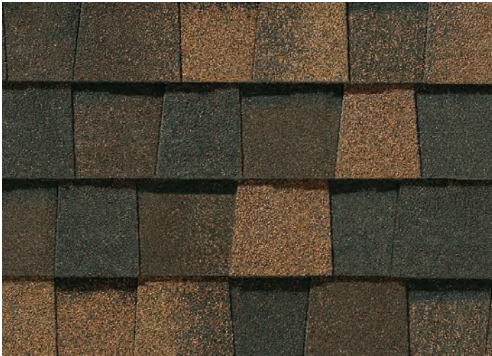
Max Def Burnt Sienna