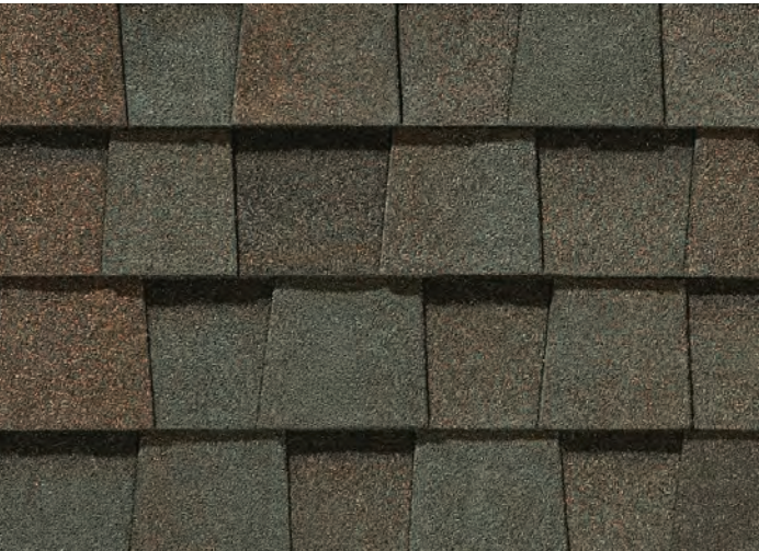
Max Def Heather Blend

Look deeper. With Max Def, a new dimension is added to shingles with a richer mixture of surface granules. You get a brighter, more vibrant, more dramatic appearance and depth of color. And the natural beauty of your roof shines through.