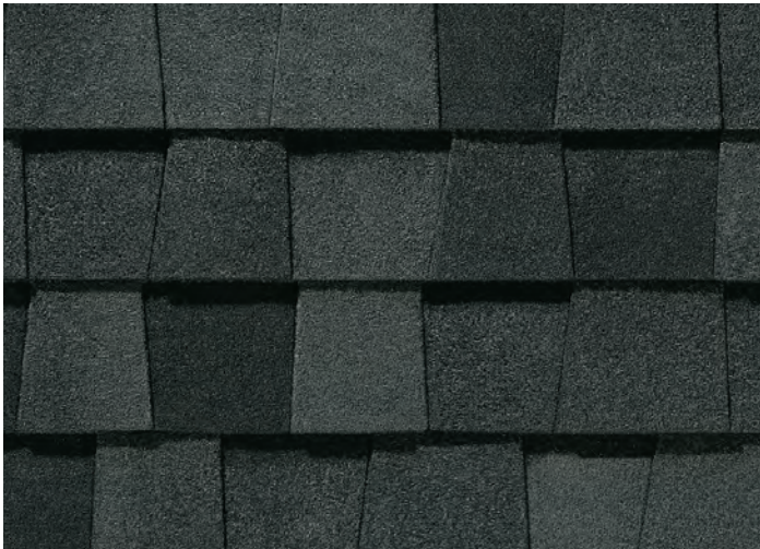
Max Def Moiré Black